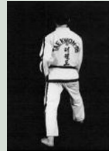
7. Move the right foot to C, turning clockwise to form a right walking stance toward C while executing a low block to C with the right forearm.