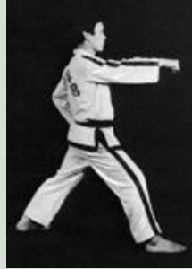
2. Move the right foot to B, forming a right walking stance toward B while executing a middle punch to B with the right fist.