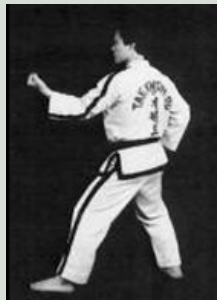
9. Move the left foot to A, forming a right L-stance toward A while executing a middle block to A with the left inner forearm.