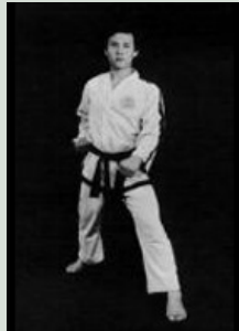
5. Move the left foot to D, forming a left walking stance toward D while executing a low block to D with the left forearm.