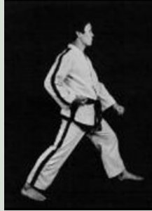
1. Move the left foot to B, forming a left walking stance toward B while executing a low block to B with the left forearm.