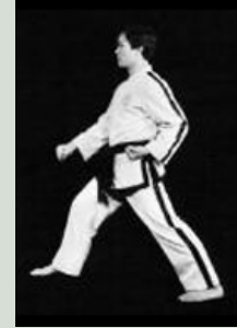
3. Move the right foot to A, turning clockwise to form a right walking stance toward B while executing a low block to A with the right forearm.