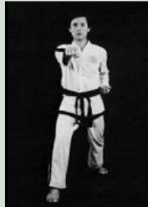
6. Move the right foot to D, forming a right walking stance toward D while executing a middle punch to D with the right fist.