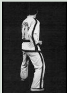
13. Move the left foot to C, forming a right L-stance toward C while executing a middle block to C with the left inner forearm.