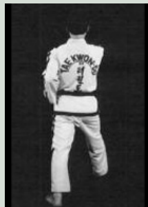
14. Move the right foot to C, forming a right walking stance toward C while executing a middle punch to C with the right fist.