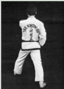
8. Move the left foot to C, forming a left walking stance toward C while executing a middle punch to C with the left fist.