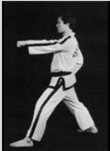
4. Move the left foot to A, forming a left walking stance toward A while executing a middle punch to A with the left fist.