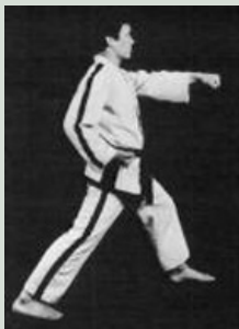
12. Move the left foot to B, forming a left walking stance toward B while executing a middle punch to B with the left fist.