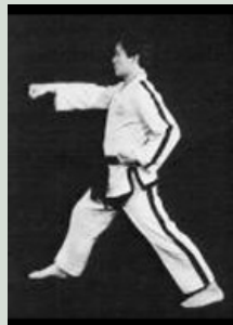
10. Move the right foot to A, forming a right walking stance toward A while executing a middle punch to A with the right fist.