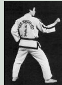
11. Move the right foot to B, turning clockwise to form a left L-stance toward B while executing a middle block to B with the right inner forearm.