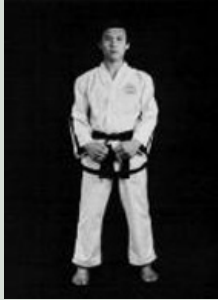
Parallel ready stance toward D.